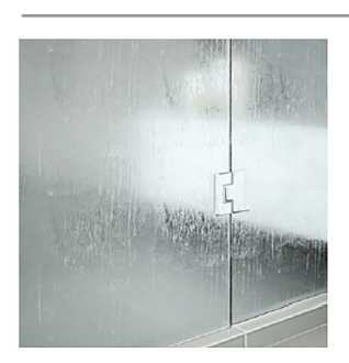
UNCOATED GLASS deteriorates starting with the very first shower.