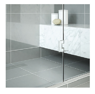
Guardian ShowerGuard® coated glass always comes clean – on day one and on and on.