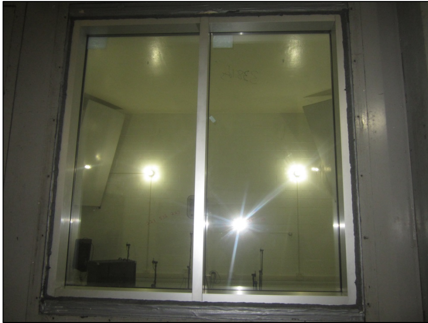
Receive Room View of Installed Test Specimen